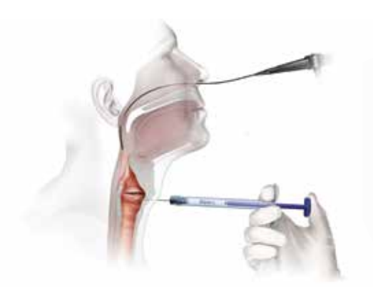
Thyroid Cartilage approach