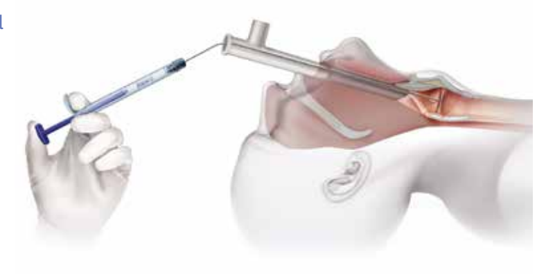
Operating Room Trans-Oral Injection

Visualization via direct laryngoscopy or micro-laryngoscopy