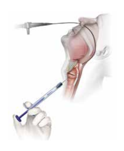
Cricothyroid Cartilage approach